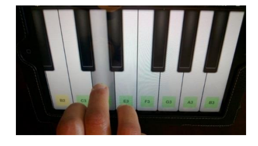
Note D (Re)