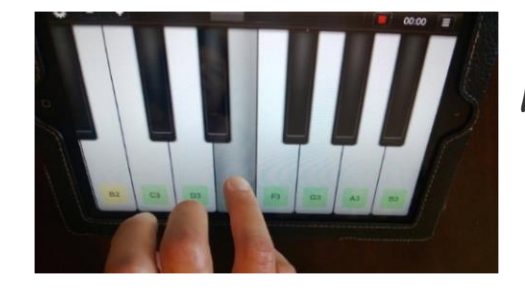
Note E (Mi)